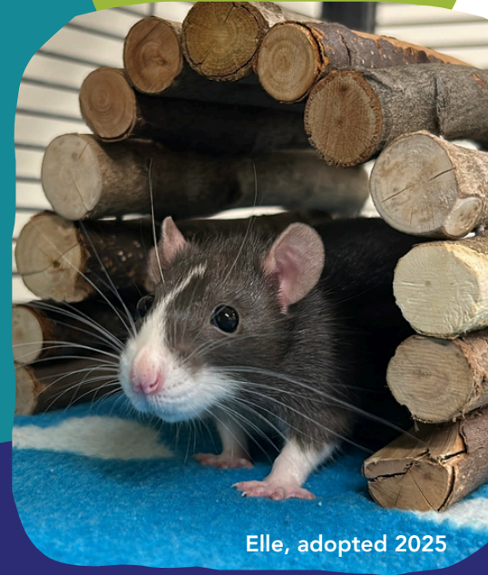
Elle, adopted 2025

bake sale, bottle drive, lemonade stand, etc.