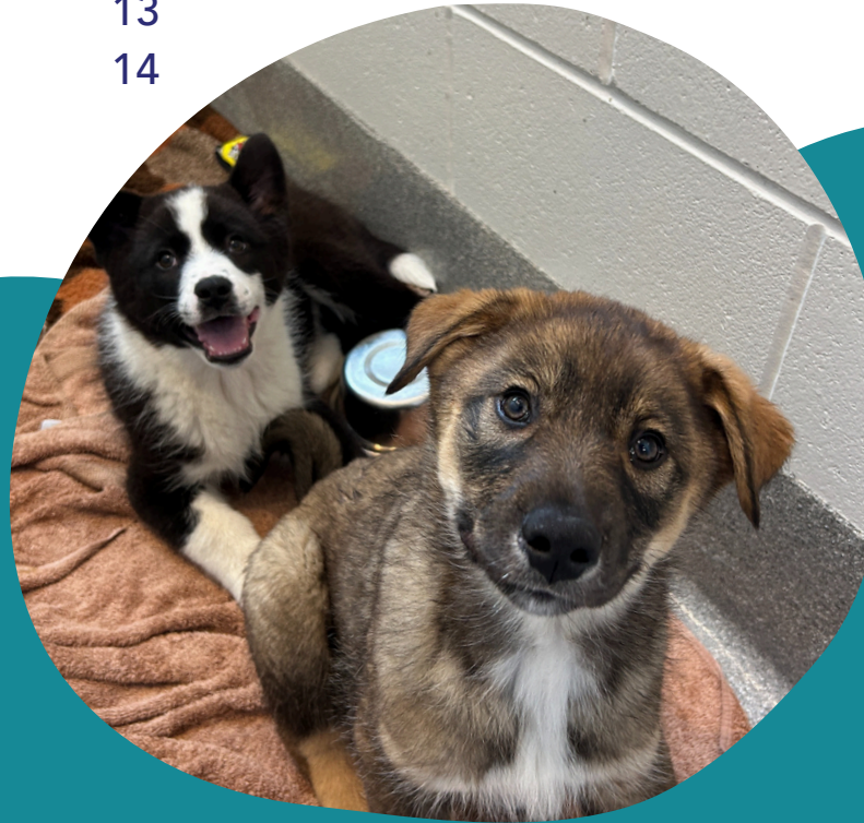
Banana & Pineapple, adopted 2025