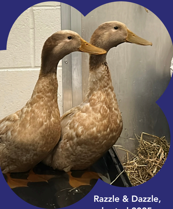
Razzle & Dazzle, adopted 2025