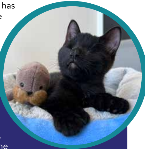
SPUD, 72 days in GHS care, adopted August 2023.

Your compassion and generosity to support Duke's Fund gave Polly the second chance she deserved. After her surgery and 111 days in care at GHS and in her foster home, Polly was adopted and is now living free from pain, because of YOU! Her new family says "Polly has not stopped wagging her tail since we brought her home and has settled in like she has spent her entire life here with us. We are feeling very lucky to have such a sweet girl."