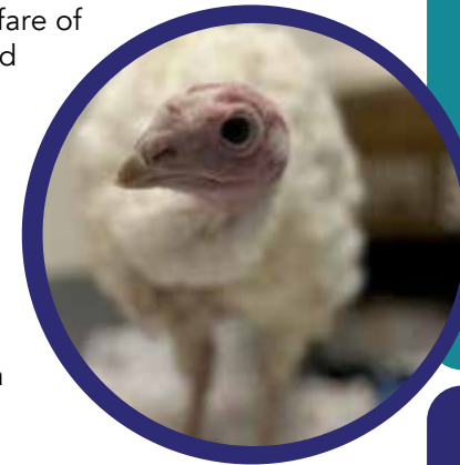
HOPE, 19 days in GHS care, adopted October 2023.

GRAS continued their investment into the welfare of lost, orphaned and abandoned farm animals in Guelph and Wellington County. In 2023, the roof of GHS's outdoor farm housing space was finally completed thanks to a gift from GRAS.