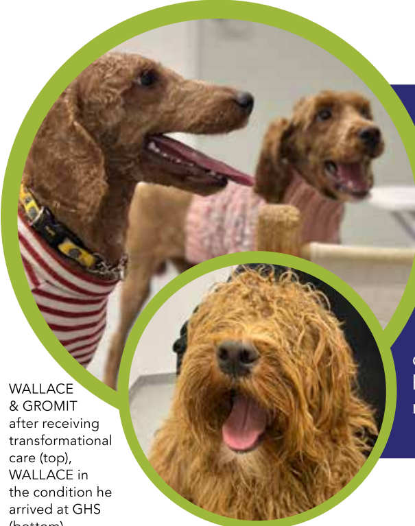
WALLACE & GROMIT after receiving transformational care (top), WALLACE in the condition he arrived at GHS (bottom).

Wallace and Gromit arrived at GHS dirty, matted and abandoned. It was clear they hadn't been cared for in a very long time. Thanks to you, we were able to turn their lives around and transform their physical condition, relieving them from the pain of their knots and unkempt fur. On top of this Wallace had been suffering in silence from a blockage in his intestines. Only because of supporters like you, Wallace's condition was diagnosed in time to save his life and we could give him the hope he needed! They are both living their best lives with their new families in their new homes.