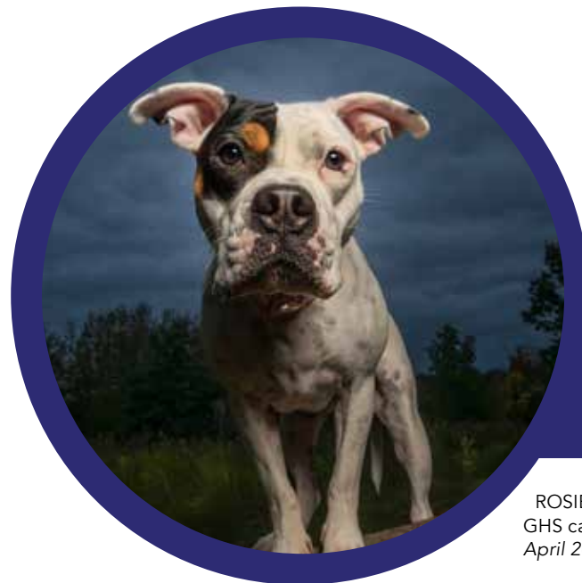
ROSIE, 22 days in GHS care, adopted April 2023.