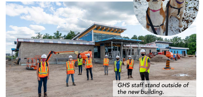
GHS staff stand outside of the new building.

Join us in reaching our fundraising goal of $10 million dollars! DONATE TODAY to Unleash Hope and build a brighter tomorrow for the animals in our community!