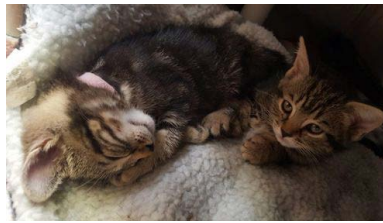
Cassia and Avalea snuggled together before getting adopted!

Stay tuned for more adoption events like this!