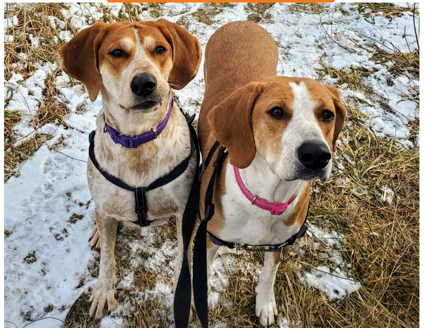
Cara and Reese are now living out their #HappyTail in their new home.

Your gift will help build the new legacy of GHS, where animals will receive the same expert and compassionate care they always have, but in a bright, modern, and comfortable facility.