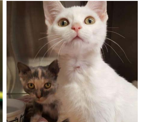
Pearl (white kitten) and Spring became quick friends while at GHS.