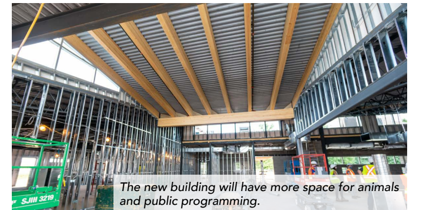
The new building will have more space for animals and public programming.

We look forward to welcoming you into our new home early 2021!