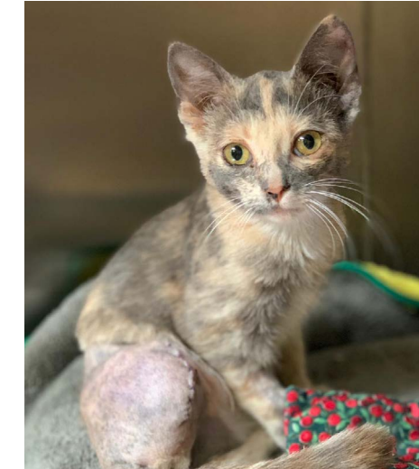
Beautiful Spring is feeling more confident each day.

As soon as both kittens are ready, they will look for their new families and #HappyTail.