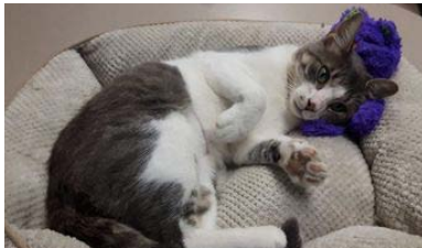
Norbert relaxing before finding his #HappyTail.